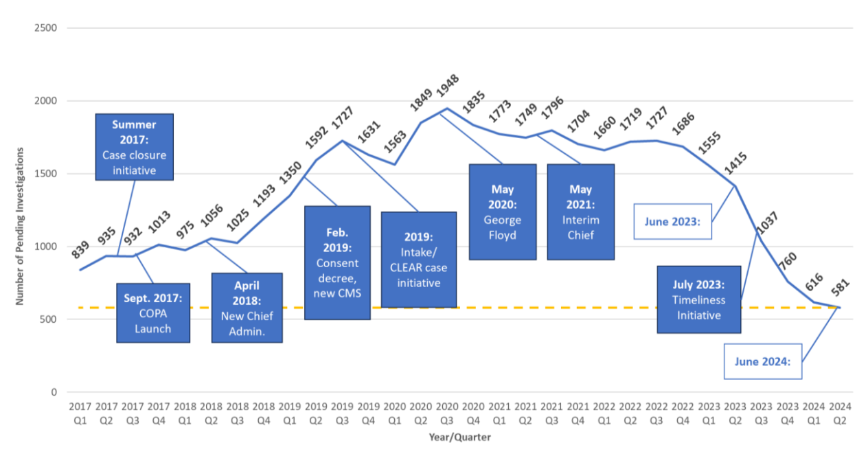
Figure 1. Historical Pending Investigations by Quarter End (2017 – 2024)

Jurisdictional expansion and increased mandates resulted in a steady increase in COPA's caseload. Fourth Amendment investigations soon began accounting for the largest percentage of COPA's investigations.<sup>3</sup> Investigations of sexual misconduct and domestic violence proved to be highly complex and resource intensive (see Section IV, below). Without a clear plan to manage these expanding investigations as the new agency launched, COPA's caseload ballooned in 2018 and 2019 (see Figure 1 below).