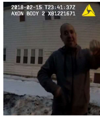
Figure #3 28