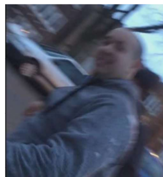
Figure #6 95