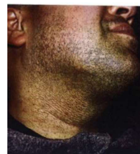
Figure #10 118