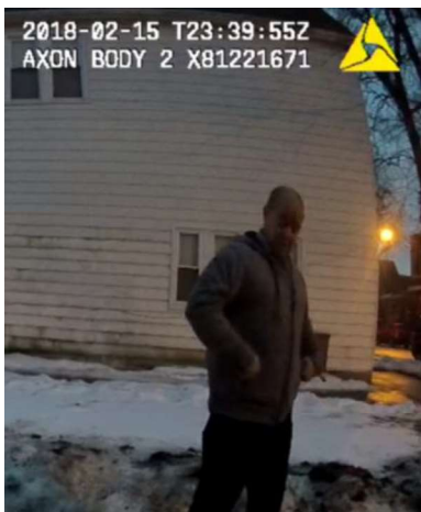
Figure #1 26