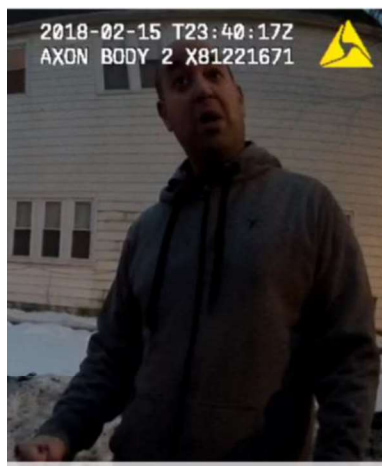
Figure #2 27