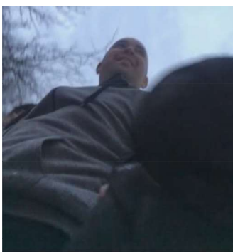
Figure #4 93

COPA reviewed video footage apparently recorded by ██████ at the scene prior to the arrival of on-duty CPD members. 92 The footage is approximately twelve seconds in length. It depicts Officer Troche-Vargas using his left hand to hold ██████ right shoulder as ██████ arises from the ground or the street (see Figure #4 below), it then depicts Officer Troche-Vargas releasing ██████ (Figure #5), and it then depicts Officer Troche-Vargas immediately afterwards (Figure #6). ██████ can be heard shouting at the officer throughout. As depicted in the video, Officer Troche-Vargas does not appear to be in distress.