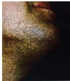
Figure #9 117